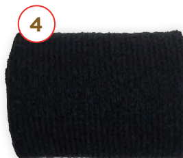
Achilles Tendon Pad Style C