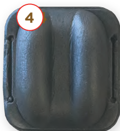
Achilles Tendon Pad Style B