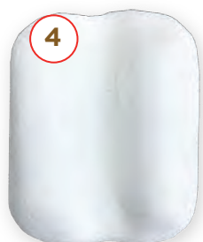
Achilles Tendon Pad Style A