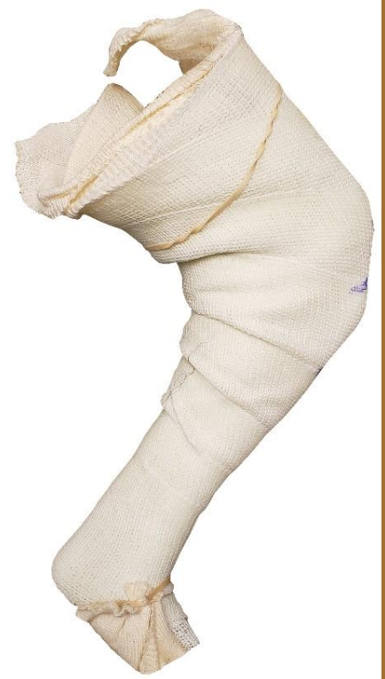
Cast Is Too Flexed