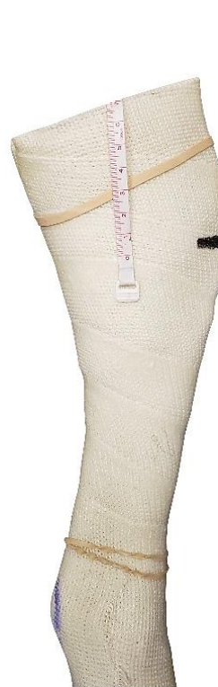
Cast Is Too Short